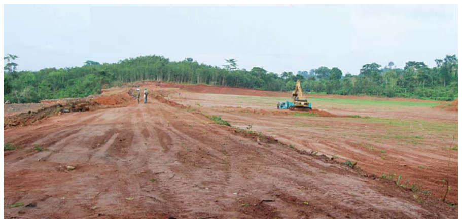
Preparation of the tailings dam to be re-utilised at Konongo.

The Company is delighted to receive this extension which ensures the long term future of the Konongo Gold Project and enables the Company to further commit to studies into the potential expansion of production. The Company now only requires an environmental permit from the Ghanaian EPA to complete the approvals required to recommence mining and production from the Project.